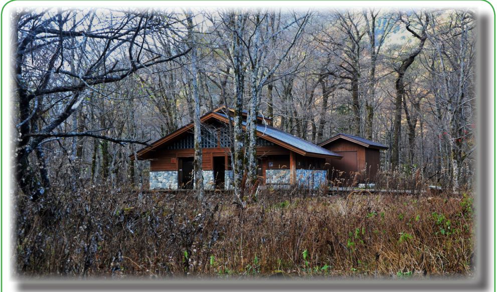
Japan Alps National Park Resort - Lies at Kamikochi Mountains in Nagano Prefecture, Japan. It is reported as one of the most scenic spot in Japan featuring vast virgin forests of birch trees and Japanese larch trees. More info about this place is available at http://www.kamikochi.or.jp/english/index.php

FOLENS students were highly encouraged to attend this trip which included discussions, lectures and opportunities to visit the most exciting Kamakochi regions and a lengendry Matsumoto area. Seventeen students from FOLENS, several students from IEAS and some teaching and coordinating staffs seems to be so friendly and cooperative among each others.